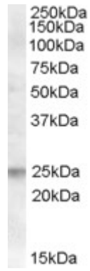
EB07613 (0.5 \mu g/ml) staining of Human Lymph Node lysate (35 \mu g protein in RIPA buffer). Primary incubation was 1 hour. Detected by chemiluminescence.