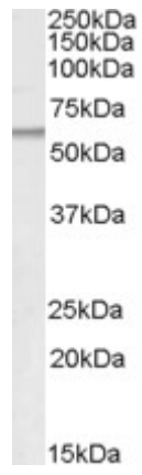
EB07671 (0.5 \mu g/ml) staining of Human Adipose lysate (35 \mu g protein in RIPA buffer). Detected by chemiluminescence.