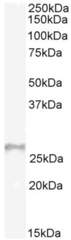
EB07685 (2 \mu g/ml) staining of Mouse Heart lysate (35 \mu g protein in RIPA buffer). Detected by chemiluminescence.