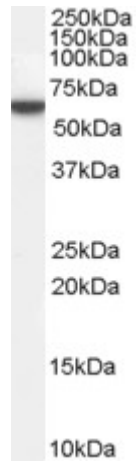
EB07727 (0.01 \mu g/ml) staining of Human Adipose lysate (35 \mu g protein in RIPA buffer). Detected by chemiluminescence.