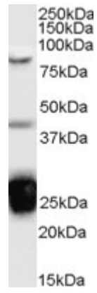
EB07741 (0.1 \mu g/ml) staining of Jurkat cell lysate (35 \mu g protein in RIPA buffer). Detected by chemiluminescence.