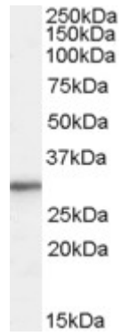
EB07869 (0.01 µg/ml) staining of HepG2 cell lysate (35 µg protein in RIPA buffer). Detected by chemiluminescence.