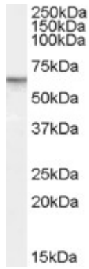
EB07935 (1 \mu g/ml) staining of Human Prostate lysate (35 \mu g protein in RIPA buffer). Primary incubation was 1 hour. Detected by chemiluminescence.