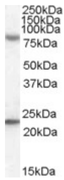
EB07981 (0.3 \mu g/ml) staining of Human Liver lysate (35 \mu g protein in RIPA buffer). Detected by chemiluminescence.