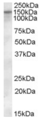
EB08088 (0.3 \mu g/ml) staining of Human Heart lysate (35 \mu g protein in RIPA buffer). Primary incubation was 1 hour. Detected by chemiluminescence.