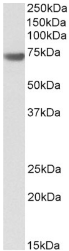
EB08096 (0.1µg/ml) staining of Human Pancreas lysate (35µg protein in RIPA buffer). Detected by chemiluminescence.