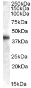
EB08213 (0.01 \mu g/ml) staining of Human Liver lysate (35 \mu g protein in RIPA buffer). Primary incubation was 1 hour. Detected by chemiluminescence.