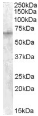
EB08289 (1µg/ml) staining of HepG2 cell lysate (35µg protein in RIPA buffer). Primary incubation was 1 hour. Detected by chemiluminescence.