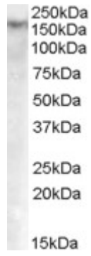
EB08317 (0.5 \mu g/ml) staining of Jurkat cell lysate (35 \mu g protein in RIPA buffer). Detected by chemiluminescence.