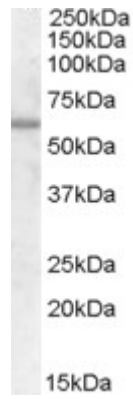
EB08348 (0.3 \mu g/ml) staining of HepG2 cell lysate (35 \mu g protein in RIPA buffer). Primary incubation was 1 hour. Detected by chemiluminescence.