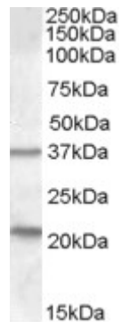
EB08380 (1 \mu g/ml) staining of Human Liver lysate (35 \mu g protein in RIPA buffer). Detected by chemiluminescence.