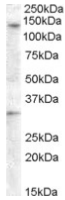
EB08535 (0.5 \mu g/ml) staining of Human Ovary lysate (35 \mu g protein in RIPA buffer). Detected by chemiluminescence.