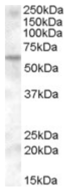
EB08538 (0.1µg/ml) staining of Human Muscle lysate (35µg protein in RIPA buffer). Primary incubation was 1 hour. Detected by chemiluminescence.