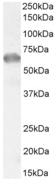
B08674 (0.1ug/ml) staining of Rat Liver lysate (35µg protein in RIPA buffer). Detected with chemiluminescence.