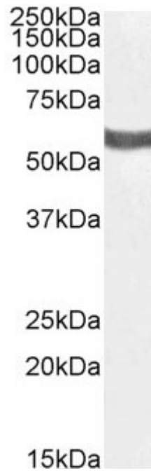
EB08830 (1µg/ml) staining of Human Kidney lysate (35µg protein in RIPA buffer). Detected by chemiluminescence.