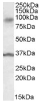
EB08835 (0.1 \mu g/ml) staining of Human Substantia Nigra lysate (35 \mu g protein in RIPA buffer). Detected by chemiluminescence.