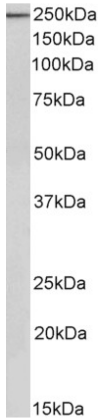
EB09020 (1µg/ml) staining of NIH3T3 lysate (35µg protein in RIPA buffer). Primary incubation was 1 hour. Detected by chemiluminescence.