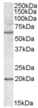
EB09032 (1 \mu g/ml) staining of HEK293 lysate (35 \mu g protein in RIPA buffer). Detected by chemiluminescence.