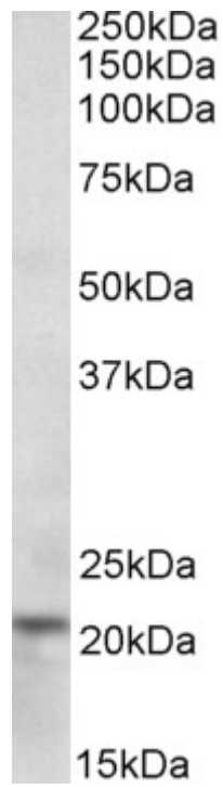
EB09091 (1 \mu g/ml) staining of Human Placenta lysate (35 \mu g protein in RIPA buffer). Detected by chemiluminescence.