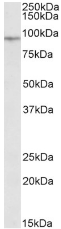
EB09167 (0.3 \mu g/ml) staining of nuclear HeLa lysate (35 \mu g protein in RIPA buffer). Primary incubation was 1 hour. Detected by chemiluminescence.