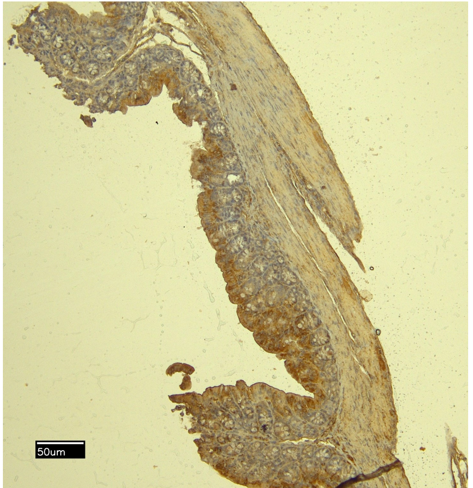
EB09192 (8µg/ml) staining of paraffin embedded Mouse Intestine. Heat induced antigen retrieval with citrate buffer pH 6, HRP-staining.