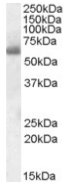
EB09216 (0.1µg/ml) staining of Human Tonsil lysate (35µg protein in RIPA buffer). Detected by chemiluminescence.