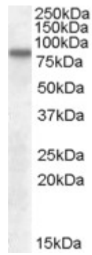
EB09295 (0.1 \mu g/ml) staining of Human Cerebral Cortex lysate (35 \mu g protein in RIPA buffer). Detected by chemiluminescence.