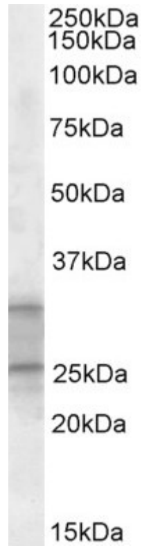
EB09427 (1 \mu g/ml) staining of Human Heart lysate (35 \mu g protein in RIPA buffer). Primary incubation was 1 hour. Detected by chemiluminescence.