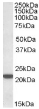
EB09445 (0.01µg/ml) staining of Human Liver lysate (35µg protein in RIPA buffer). Detected by chemiluminescence.