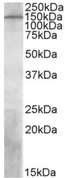
EB09549 (1 \mu g/ml) staining of Human Temporal Cortex lysate (35 \mu g protein in RIPA buffer). Primary incubation was 1 hour. Detected by chemiluminescence.