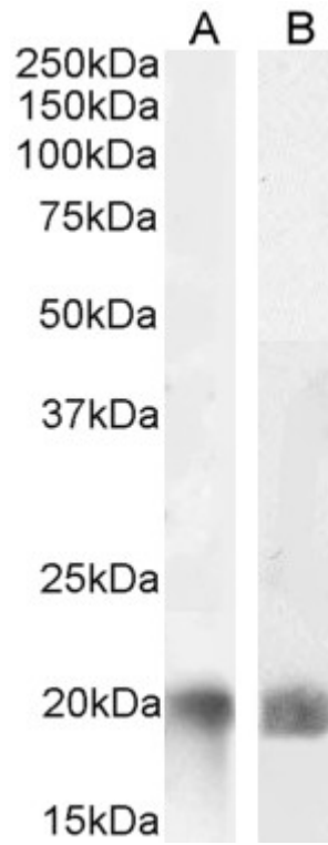
EB09588 (0.03 \mu g/ml) staining of Human Cerebellum (A) and Frontal Cortex (B) lysate (35 \mu g protein in RIPA buffer). Detected by chemiluminescence.