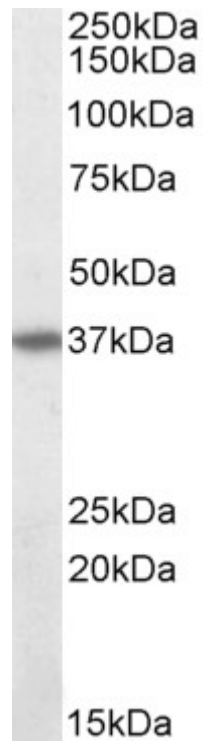
EB09626 (0.1 \mu g/ml) staining of MOLT4 lysate (35 \mu g protein in RIPA buffer). Detected by chemiluminescence.