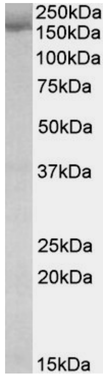
EB09717 (0.03 \mu g/ml) staining of K562 lysate (35 \mu g protein in RIPA buffer). Primary incubation was 1 hour. Detected by chemiluminescence.