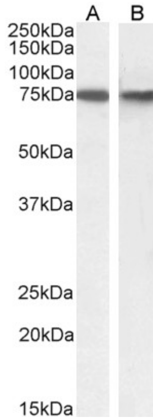
EB09792 (1 \mu g/ml) staining of HeLa (A) and (0.1 \mu g/ml) U2OS (B) cell lysate (35 \mu g protein in RIPA buffer).. Detected by chemiluminescence.