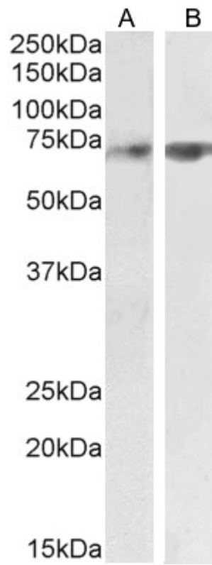
EB09821 (2 \mu g/ml) staining of Human Cerebellum (A) and Rat Lung (B) lysate (35 \mu g protein in RIPA buffer). Detected by chemiluminescence.