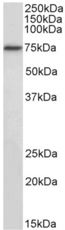
EB10082 (2 \mu g/ml) staining of NIH3T3 nuclear lysate (35 \mu g protein in RIPA buffer). Primary incubation was 1 hour. Detected by chemiluminescence.