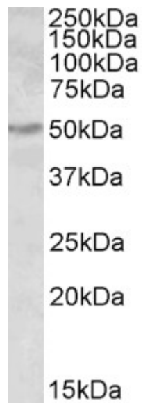
EB10130 (0.3 \mu g/ml) staining of Human Kidney lysate (35 \mu g protein in RIPA buffer). Primary incubation was 1 hour. Detected by chemiluminescence.