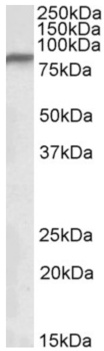
EB10188 (0.3 \mu g/ml) staining of Human Heart lysate (35 \mu g protein in RIPA buffer). Detected by chemiluminescence.