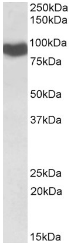
EB10306 (0.1 µg/ml) staining of Rat Liver lysate (35 µg protein in RIPA buffer). Detected by chemiluminescence.