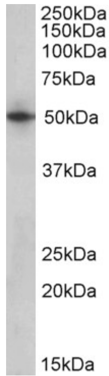
EB10427 (1 \mu g/ml) staining of Human Heart lysate (35 \mu g protein in RIPA buffer). Detected by chemiluminescence.