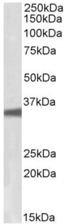
EB10456 (0.1 \mu g/ml) staining of HepG2 lysate (35 \mu g protein in RIPA buffer). Primary incubation was 1 hour. Detected by chemiluminescence.