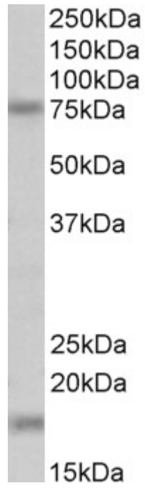
EB10507 (0.1 \mu g/ml) staining of Mouse Kidney lysate (35 \mu g protein in RIPA buffer). Primary incubation was 1 hour. Detected by chemiluminescence.