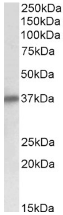
EB10758 (0.1 \mu g/ml) staining of Human Heart lysate (35 \mu g protein in RIPA buffer). Primary incubation was 1 hour. Detected by chemiluminescence.