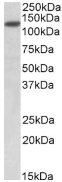
EB10826 (0.05 \mu g/ml) staining of Jurkat lysate (35 \mu g protein in RIPA buffer). Primary incubation was 1 hour. Detected by chemiluminescence.