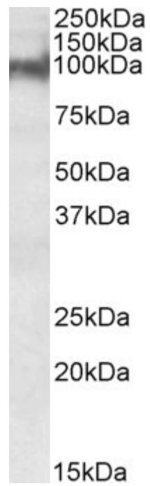
EB10841 (0.3 \mu g/ml) staining of Mouse Heart lysate (35 \mu g protein in RIPA buffer). Detected by chemiluminescence.