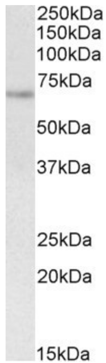
EB10884 (1 \mu g/ml) staining of Human Spleen lysate (35 \mu g protein in RIPA buffer). Primary incubation was 1 hour. Detected by chemiluminescence.