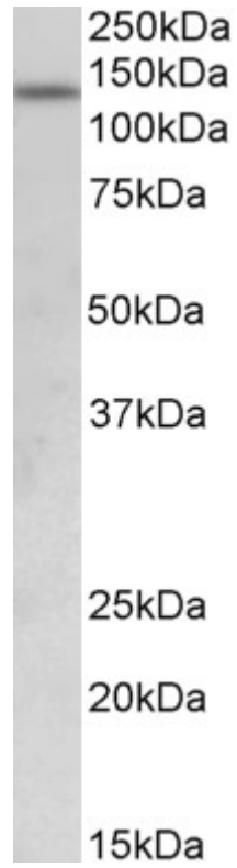
EB10899 (0.5 \mu g/ml) staining of Human Uterus lysate (35 \mu g protein in RIPA buffer). Primary incubation was 1 hour. Detected by chemiluminescence.