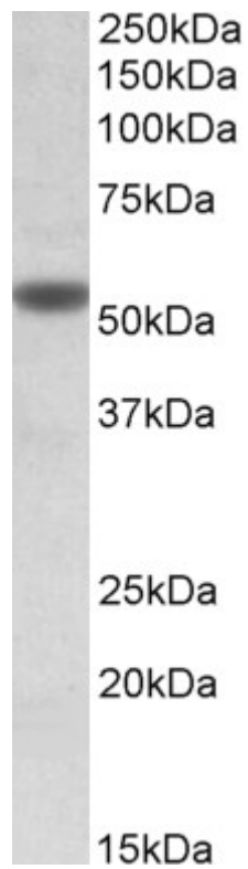
EB10968 (1 \mu g/ml) staining of KELLY lysate (35 \mu g protein in RIPA buffer). Detected by chemiluminescence.