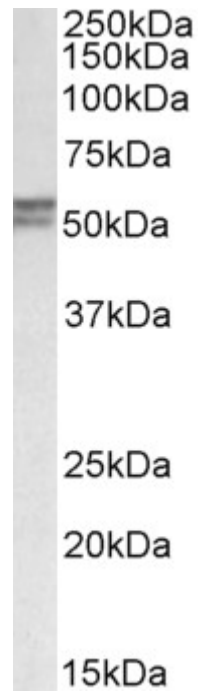
EB11003 (0.5µg/ml) staining of Mouse Duodenum lysate (35µg protein in RIPA buffer). Detected by chemiluminescence.