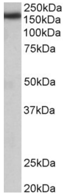
EB11087 (0.05 \mu g/ml) staining of Rat Brain lysate (35 \mu g protein in RIPA buffer). Primary incubation was 1 hour. Detected by chemiluminescence.